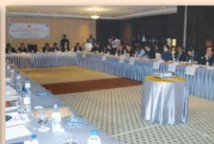
The opening ceremony on 22 November 2007 at Genting International Convention Centre, First World Hotel, Genting Highlands, Malaysia