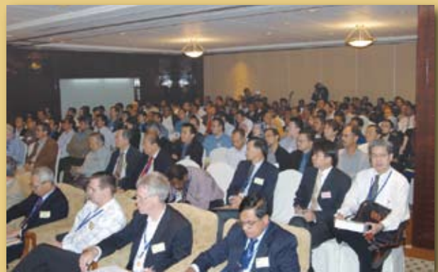
A well-attended seminar

More than 100 engineers from the various states in Malaysia attended the half-day seminar at First World Hotel, Genting Highlands.