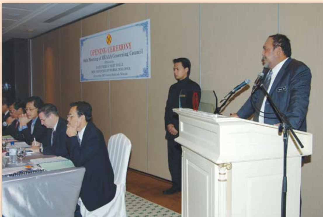
Honourable Deputy Minister of Works, Malaysia Dato' Ir. Mohd Zin bin Mohamed delivering the opening speech on behalf of the Hon. Minister of Works, Dato Seri S. Samy Vellu

The Minister proposed that REAAA to collaborate with funding agencies such as World Bank and the Asian Development Bank to finance projects initiated by REAAA. He suggested REAAA to take up a common project within a certain country to be funded by these agencies.