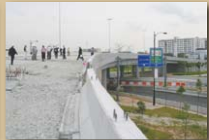
Briefing for Council members and HORA delegates before taking them for a site visit of the project