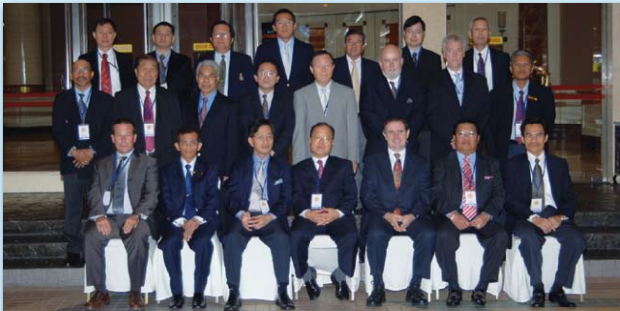
A group photograph taken just before the 84 th Council Meeting at First World Hotel, Genting Highlands, Malaysia

The 84 th Meeting of the REAAA Governing Council has been successfully concluded on 22 November 2007 in Genting Highlands, Malaysia. Several important decisions were made and proposals presented to further strengthen REAAA, making it a very fruitful meeting. It was attended by 22 Council members. HORA delegates from 13 countries attending the inaugural meeting of the Disaster Risk management Advisory Group were invited and attended the Council meeting as observers.