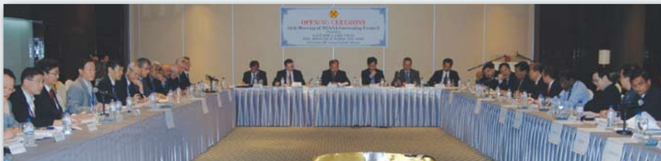
Representatives from 13 countries attending the inaugural meeting of the Advisory Group in Genting Highlands, Malaysia